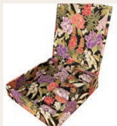
Cartonage jewellery boxes