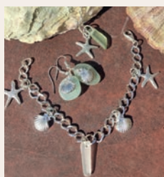
Silver seaglass jewellery