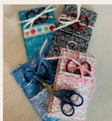
Cartonage scissor cases (inc. scissors)