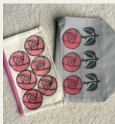
Charles Rennie Mackintosh zipped pouch bags