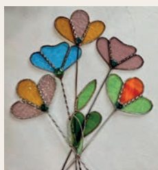
Stained glass flowers