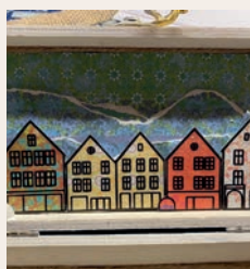
Tobermory treasure box