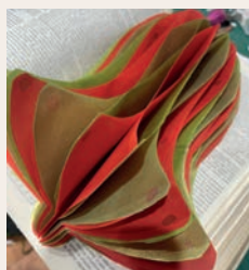
Retro Christmas decorations