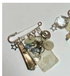
Vintage charm brooches