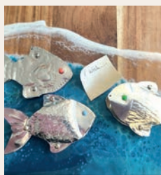
Hand embossed wishing fish