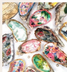
Oyster shell trinket dishes