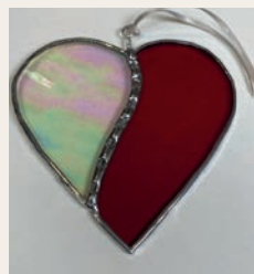
Stained glass heart