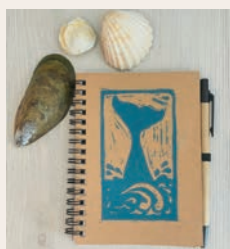
Lino printed notebooks