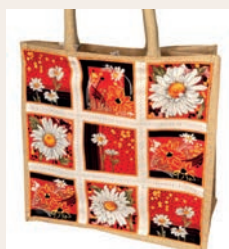
Hand embossed bags for life