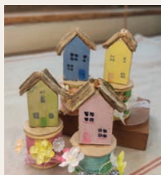
Cotton Reel Cottages