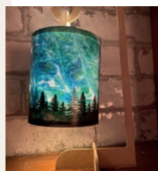
Marbled lanterns (with LED candle)