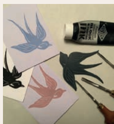
Intro to lino-printing