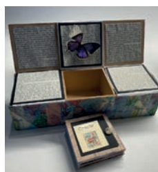
Puzzle box with a secret book