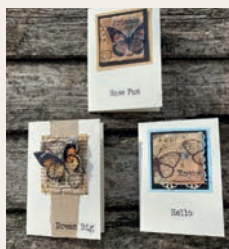
Time for tea notebook and cards